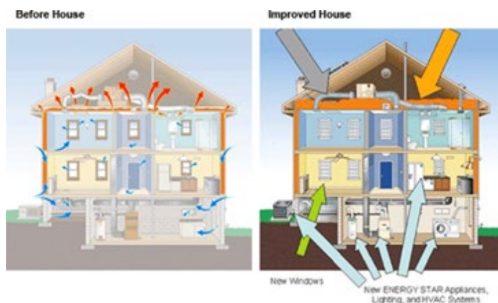
FIGURE 5: ENERGY EFFICIENCY MEASURES UNDER THE CLEAN ENERGY UPGRADE FINANCING PROGRAM

Pursuant to Public Resources Code Section 26081, in 2012, CAEATFA transferred an initial $5,000,000 to its trustee bank to launch the Clean Energy Upgrade Financing Program. As of the program's sunset, $599,051.18 in loss reserve contributions had been encumbered on behalf of lenders for their enrolled loans, and one claim in the amount of $33,012.58 was subsequently received and paid. Of the initial $5,000,000 transferred to the trustee bank, $4,400,948.82 in unencumbered funds was returned to the California Energy Commission in April 2015. In May 2015, the remaining loss reserves, totaling $599,051.18, were transferred from the trustee bank to CAEATFA to support program obligations to lenders through the loan enrollment terms.