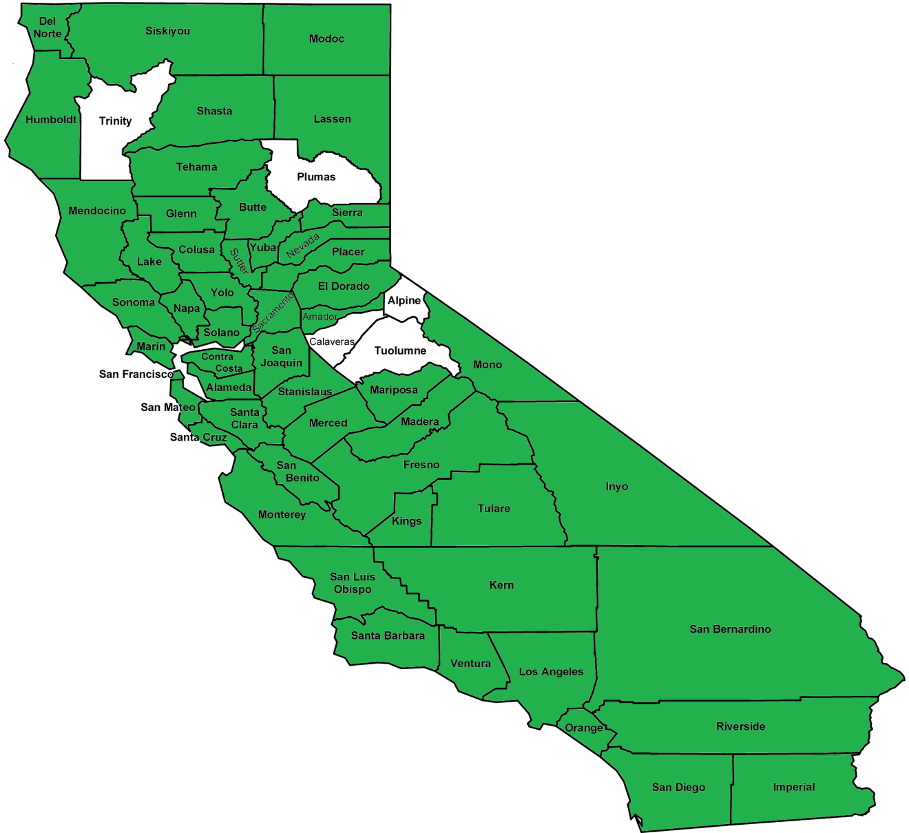
FIGURE 3: COUNTIES SERVED BY ENROLLED PACE PROGRAMS