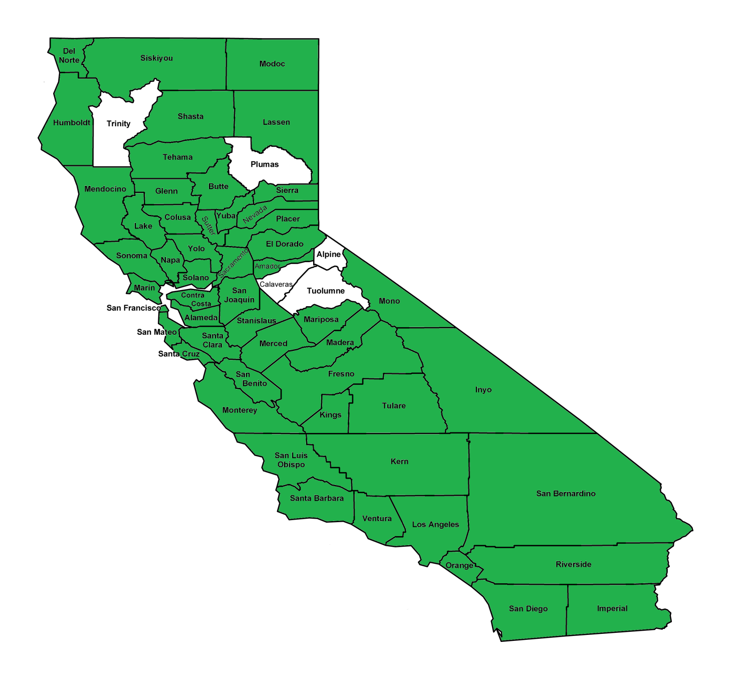
FIGURE 3: COUNTIES SERVED BY ENROLLED PACE PROGRAMS