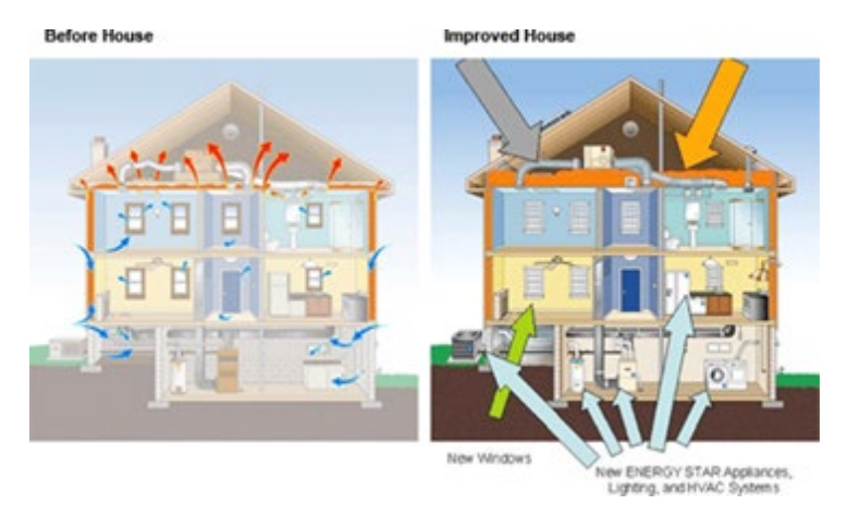
FIGURE 5: ENERGY EFFICIENCY MEASURES UNDER THE CLEAN ENERGY UPGRADE FINANCING PROGRAM

Pursuant to Public Resources Code Section 26081, in 2012, CAEATFA transferred an initial $5,000,000 to its trustee bank to launch the Clean Energy Upgrade Financing Program. As of the program's sunset, $599,051.18 in loss reserve contributions had been encumbered on behalf of lenders for their enrolled loans, and one claim in the amount of $33,012.58 was subsequently received and paid. Of the initial $5,000,000 transferred to the trustee bank, $4,400,948.82 in unencumbered funds was returned to the Calfornia Energy Commission in April 2015. In May 2015, the remaining loss reserves, totaling $599,051.18, were transferred from the trustee bank to CAEATFA to support program obligations to lenders through the loan enrollment terms.