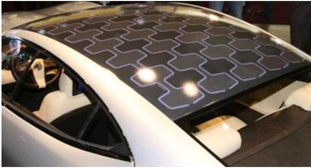
Automotive Solar Roof