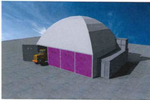
PERSPECTIVE VIEW - FRONT