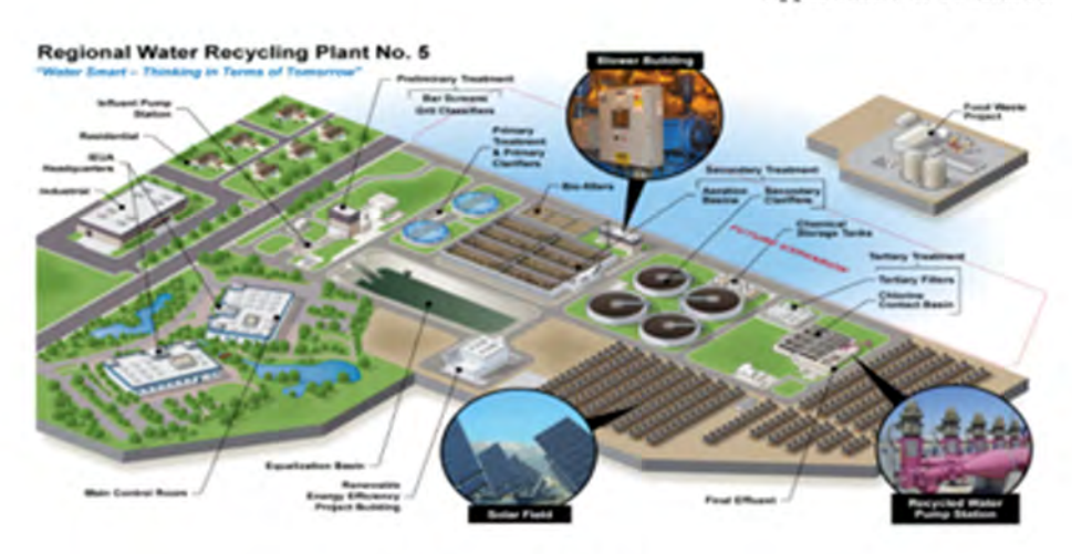
Figure 1: RP-5 Facilities