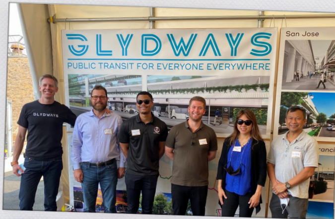
Glydways R & D