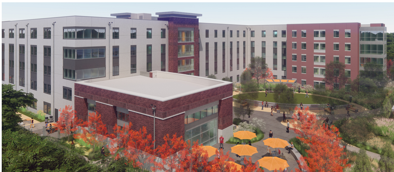
A model rendition of the Santa Rosa Junior College on-campus student housing.

The financing also required the collaborative efforts of the State Treasurer's Public Finance Division, the Department of Finance, the California Department of Education, the California Attorney General's office, as well as the California Community Colleges' Chancellor's Office. It was a true multi-agency effort!