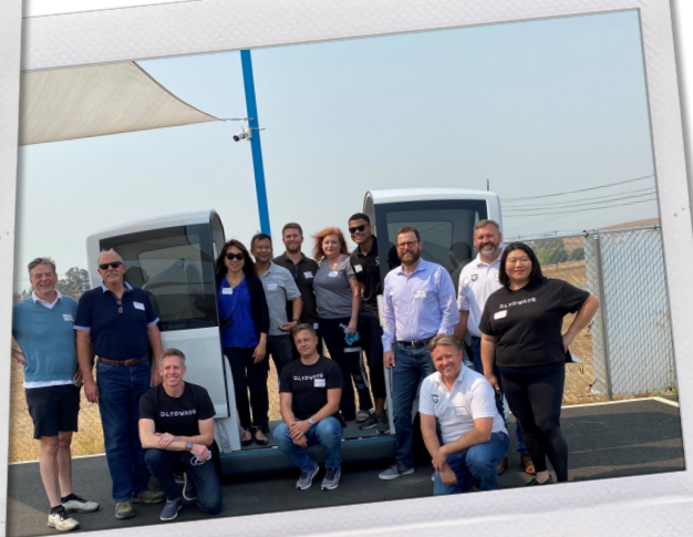
Glydways R & D