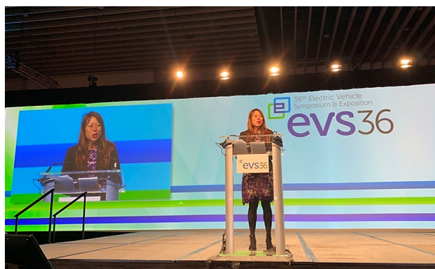
Treasurer Fiona Ma delivers opening remarks at the Electric Drive Transportation's 36th Electric Vehicle Symposium and Exposition.

June 12 – State Treasurer Fiona Ma provided the opening remarks to the Electric Drive Transportation Association's 36th Electric Vehicle Symposium and Exposition (EVS36). EVS36 is the longest-running international conference devoted to electric transportation and technologies as well as the premier showcase for the industry's innovation through exhibition. Treasurer Ma spoke on how California is leading the charge and driving the transition to electric mobility and how her office is assisting the state reach its zero-emission goals through two of the Authorities she chairs: California Alternative Energy and Advanced Transportation Financing Authority and California Pollution Control Financing Authority.