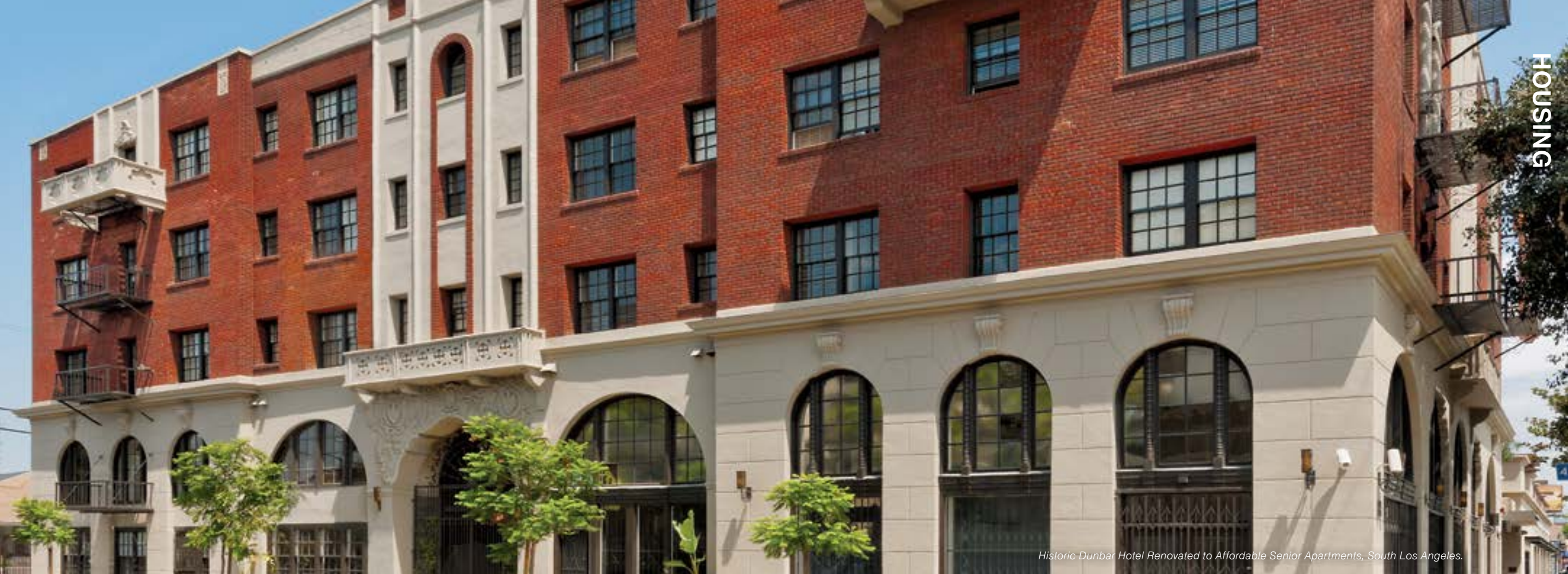
Historic Dunbar Hotel Renovated to Affordable Senior Apartments, South Los Angeles.