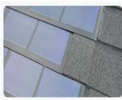
Ideal Applications for Flexible Ultra-Barriers