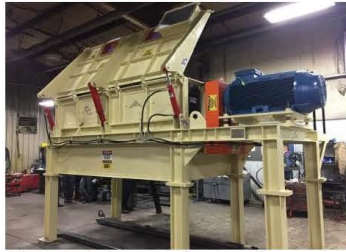
Figure 1: Rotary Impact Separator