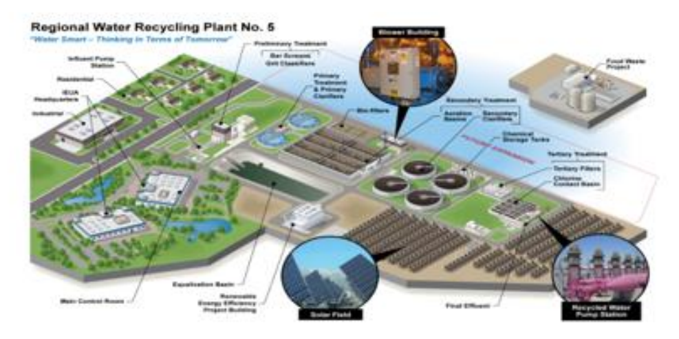
Figure 1: RP-5 Facilities