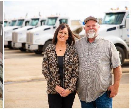
Triple E Trucking Bakersfield