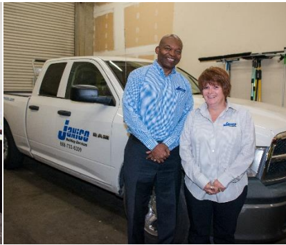
Janico Building Services North Highlands