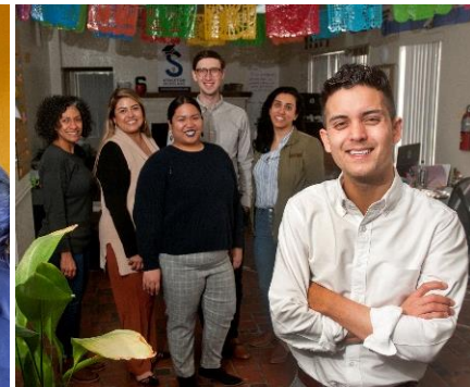
Reinvent Stockton Foundation Stockton