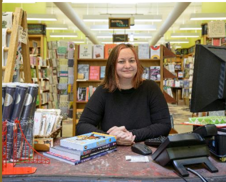
The Booksmith San Francisco