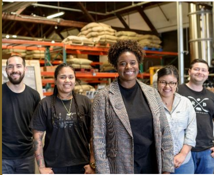
Red Bay Coffee Oakland

CalSavers employers span the state from Eureka to San Diego and represent the diversity of the great State of California. They include small and large businesses, non-profit organizations, household name companies and start-ups, and they employ full-time, part-time, seasonal, long-term, and mobile employees of all ages. More than 600 employers had registered as of the end of the year.