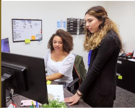
A.A.R.C. Center Foundation San Diego