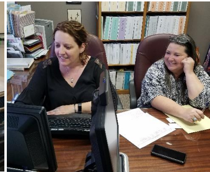
3 Core Chico