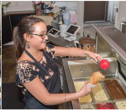
Penny Ice Creamery Santa Cruz