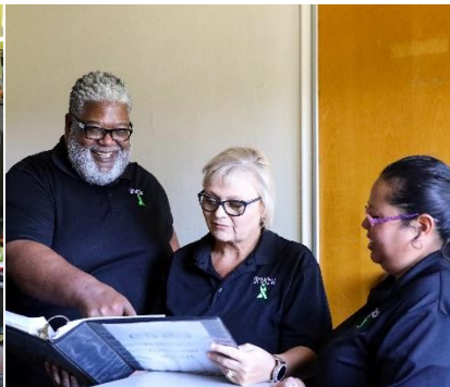
Ruby's Valley Care Home Fresno