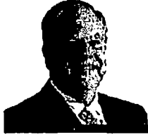
Bill Lockyer California State Treasurer