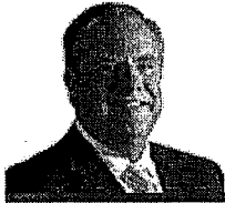
Bill Lockyer California State Treasurer