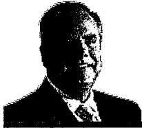
Bill Lockyer California State Treasurer