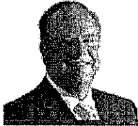
Bill Lockyer California State Treasurer