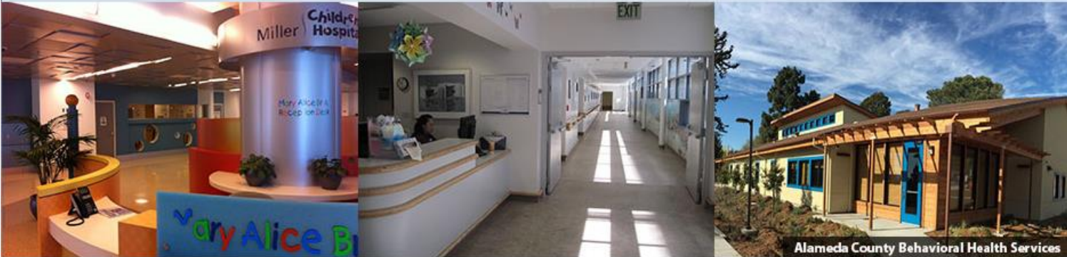
Alameda County Behavioral Health Services

Increases access to oral health care for special health care needs populations through the development and expansion of specialty dental clinics