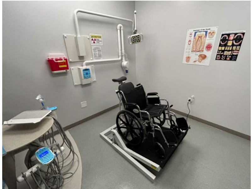
Specialized Treatment Area with Versatilt Equipment used to Treat Patients with Disabilities