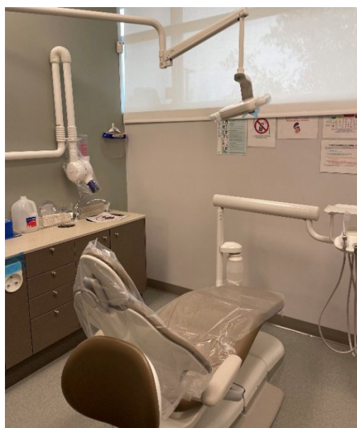
Standard Treatment Area