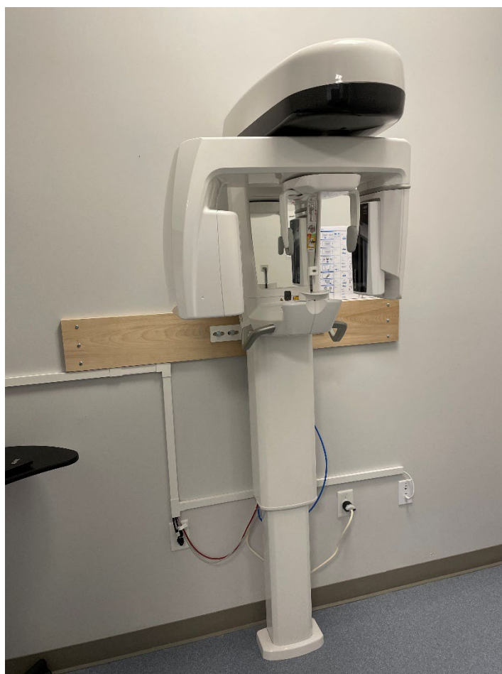
Panoramic Imaging Machine used to Scan Patients with Disabilities