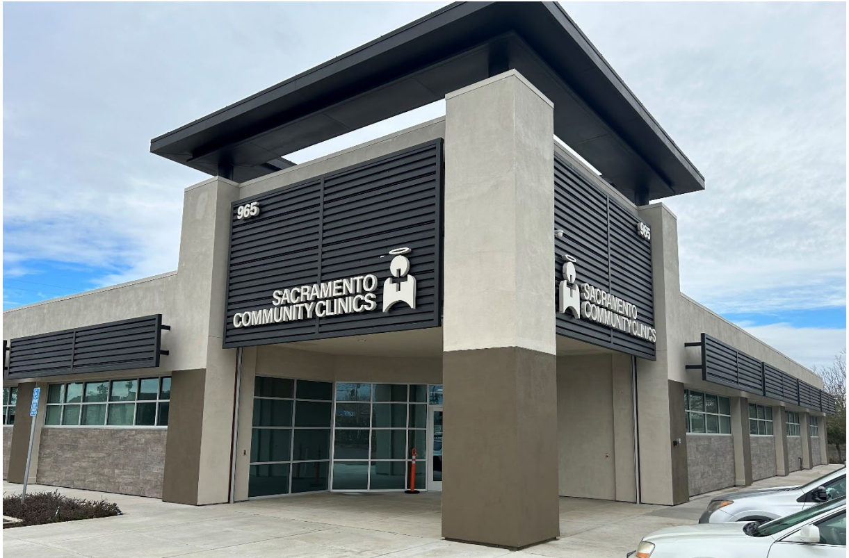
The Alta California Regional Center/Health and Life Organization Clinic, located at 965 El Camino Avenue, Sacramento, CA 95815