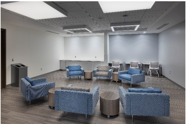
Family Counseling Room