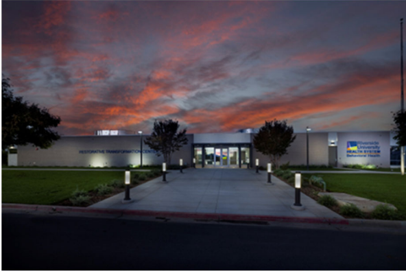
Front of the Building