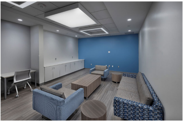
Small Group Room