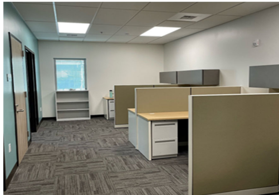
Administrative Office Space