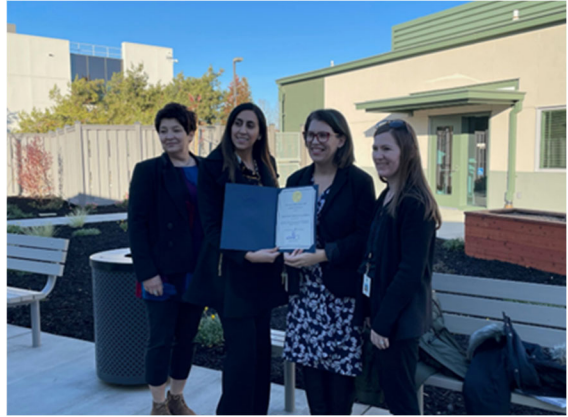
CHFFA Staff with Solano County Behavioral Health