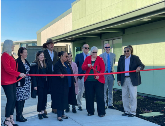
Ribbon Cutting Ceremony