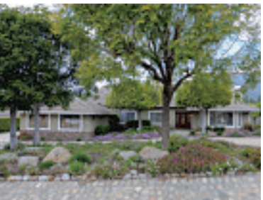
CLAREMONT - 891 Deep Springs Drive

Gary Ingham • 310.713.1400 CalBRE#01339121