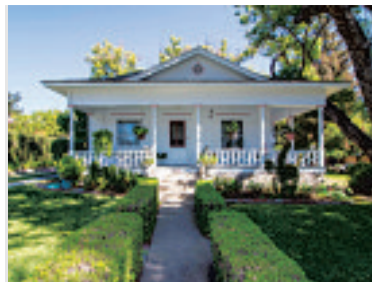
GLENDORA - 546 N. Wabash Avenue

Beautiful 1904 home in the heart of North Glendora on a 16,000 SF lot! Rare opportunity to own such an amazing property close to EVERYTHING - schools, park, downtown Glendora Village, future gold line station, shopping, etc. This home is a must see! $779,999