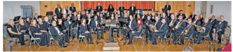
The Pomona Concert Band conductors, above. The band will perform at 3 p.m. Sunday, May 19, in the Palomares Park Community Center.