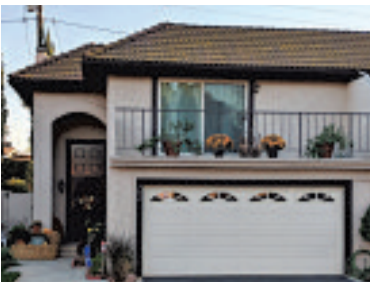
COVINA - 702 E. Rowland Street

Catherine Battaglia • 626.483.5083 CalBRE#00756083