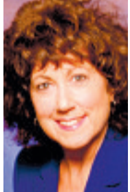
Adriana Donofrio Real Estate

If you are a buyer hoping to be the winning bid, try to avoid making these common mistakes when writing your purchase offer.