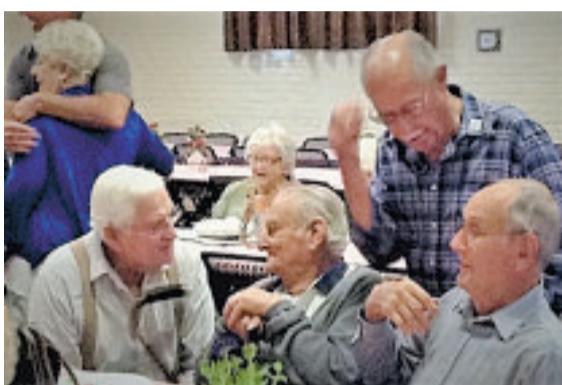
The picnic celebrates the past and builds community bonds for the future.

The Chino Valley Historical Society will host the 94th Annual Pioneer Picnic at the Chino Community Building Sunday, May 19, with doors open at 11 a.m. and luncheon at 12 noon. The Old Schoolhouse Museum and old Chino Jail will be open 11 a.m. to 2 p.m. to visit before or after the potluck luncheon festivities.