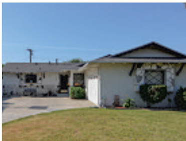
GLENDORA - 1464 Lawford Street

Stacy Dover • 626.429.7361 CalBRE#01768476