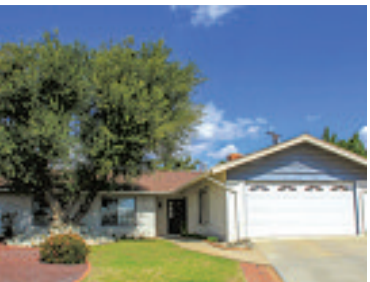
GLENDORA - 916 Bradish Avenue