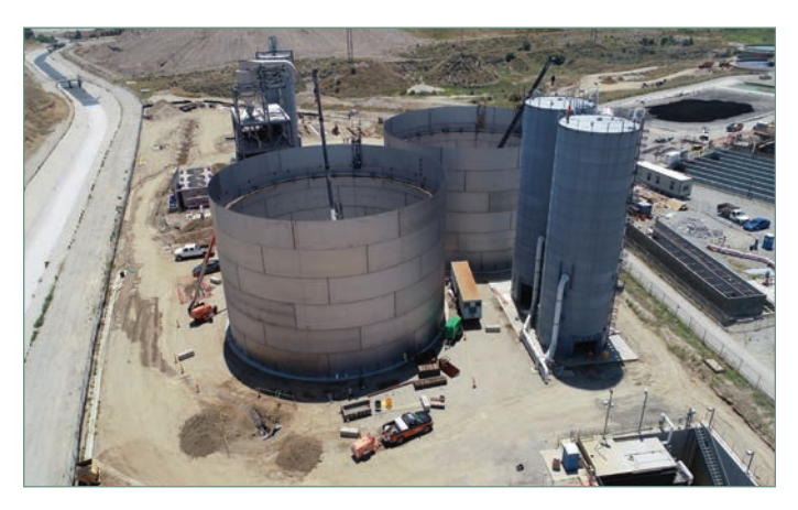
The Rialto Bioenergy Inc. facility in San Bernardino County.

Bioenergy Facility. The borrower, Rialto Bioenergy Inc., is a small business located in San Bernardino County. Bond proceeds will be used to develop and build a nonhazardous solid waste treatment and disposal facility and purchase equipment.