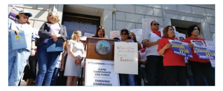
Treasurer Ma joined workers and pension trustees in April to urge asset managers nationwide to adopt tougher principles to stem workplace sexual harassment and protect workers.

cardiovascular health solutions, and the retention and creation of 974 production jobs and 90 construction jobs.