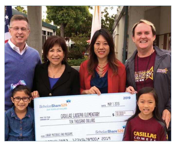
Delivering $10,000 to Joseph Casillas Elementary in Chula Vista marking 20 schools visited and $305,000 provided for extracurricular enrichment.

In April, CDIAC published an updated user-friendly and interactive version of the <u>California Debt Financing Guide</u> known commonly as the "Bible" for local investment professionals, public finance officers, policy makers, and members of the public when issuing debt to finance public projects.