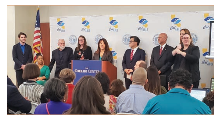
At the December launch of the CalABLE program, which now provides eligible Californians with the ability to save more money in disability-related tax-advantaged investments.

Within the State's investment portfolio is a little-known, but powerful program called the <u>Time Deposit Program</u> that is designed to place state deposits in community banks that are headquartered in California. These are the same banks that provide loans to small businesses to help them grow and employ more Californians. This program presently has funds on deposit with about 70 of California's independent banks and credit unions. At the end of the June 2019, the STO had close to $5 billion invested in California banks.