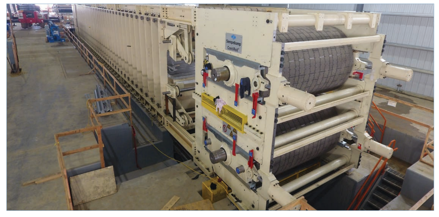
Above is the CalPlant I press that will be used in the manufacturing process.