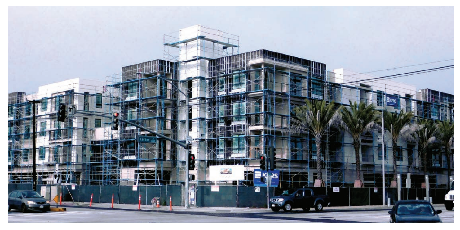
Construction of Carson Veterans Village housing development.

• Embraced <u>CalSavers' procurement of an Environmental,</u> <u>Social, and Governance investment option</u> in January making California the first among peer states to offer a sustainable investing option.