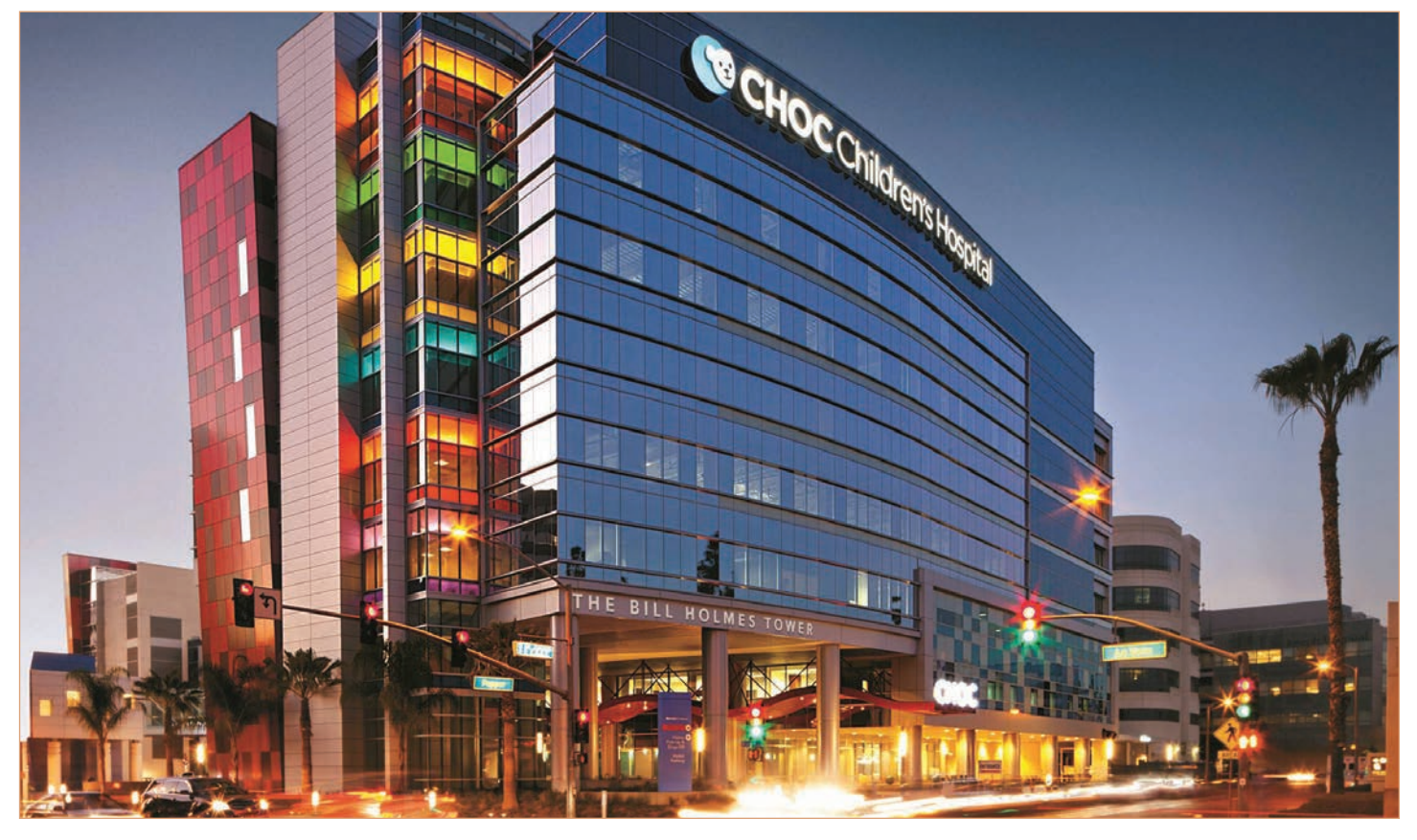
Rendering of Children's Hospital of Orange County.