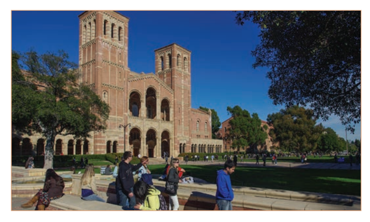
University of California, UCLA campus

$5.15 billion in voter-approved general obligation bonds, including $1.47 billion for new projects and $3.68 in refunding bonds. The refunding of bonds will save the State's General Fund $1.42 billion over the next 19 years, or $1.1 billion on a present value basis.