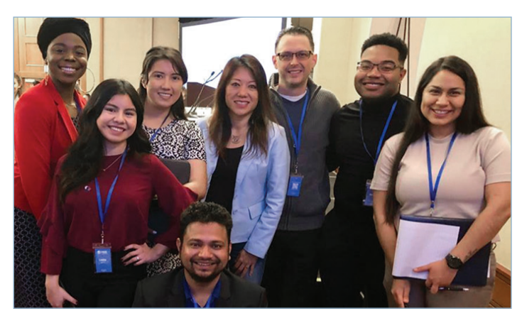
With California State University students in Sacramento for a discussion panel and their legislative lobby day to #FixFinancialAid.