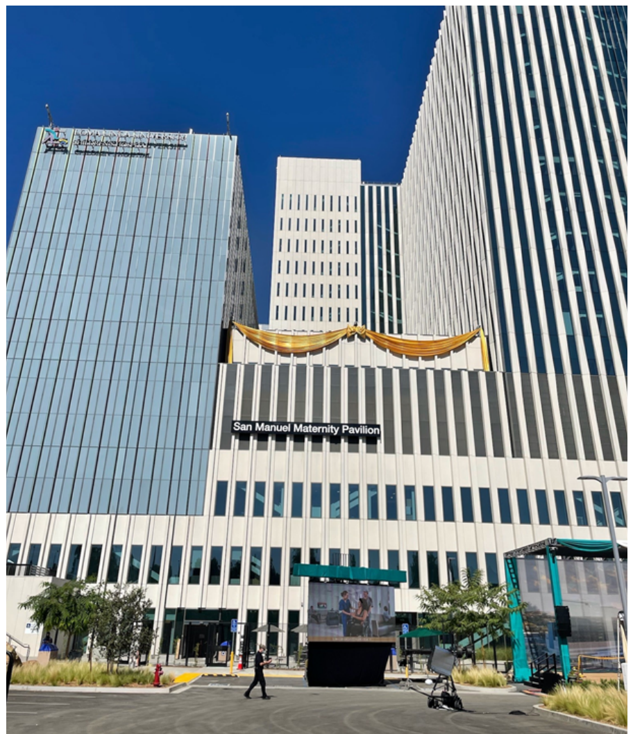
The completed campus, including the Maternity Pavilion, Children's Tower, and Adult Tower.

Loma Linda University Children's Hospital received its first Children's Hospital Program grant award through CHFFA in October 2009, when it was awarded $6.1 million in reimbursements for the prior purchase of patient care equipment. In September 2015, it was awarded another $165.9 million to help construct the new Children's Hospital. The Children's Hospital Program is funded through three tranches of general obligation bonds authorized by the voters of the state in 2004, 2008, and 2018. These three bond acts provided a total of $3.2 billion to improve the health and welfare of California's critically ill children by providing a stable and ready source of funds for capital improvement projects for children's hospitals.