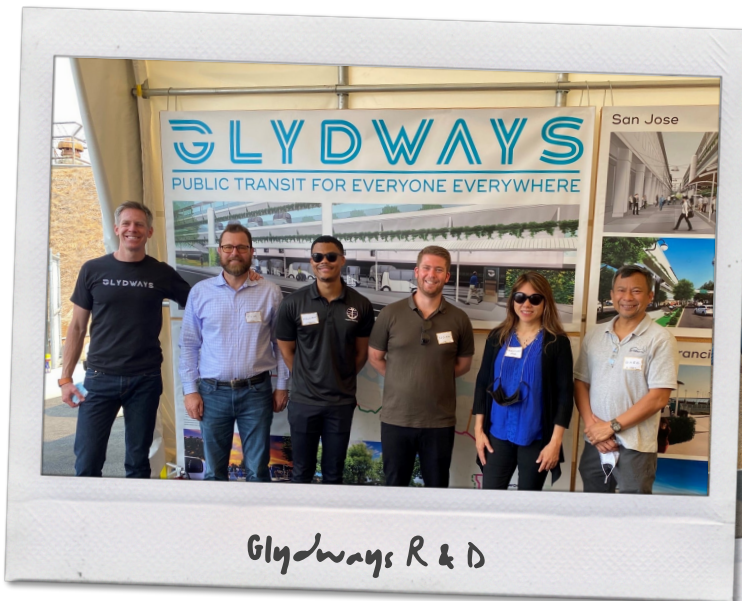
Glydways R & D