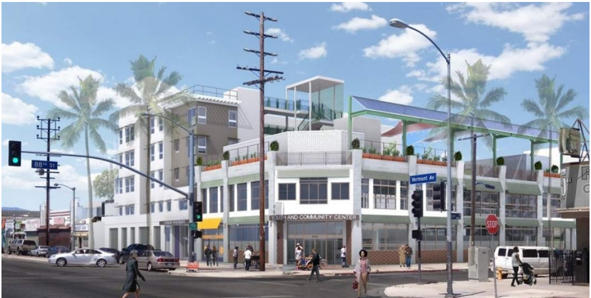
Pictured above is a rendering of WORKS' 88th and Vermont Streets project in Los Angeles County.

Through the California Tax Credit Allocation Committee (CTCAC), private investors receive Federal, and sometimes also State, Low-Income Housing Tax Credits as an incentive to make equity investments in affordable rental housing.