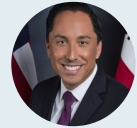
Mayor Todd Gloria, City of San Diego

It takes a lot of folks to build projects like this. It takes a village to build a village like this one, but the good news right now is that we have help all around us. We have a group of leaders that are willing to drive change.