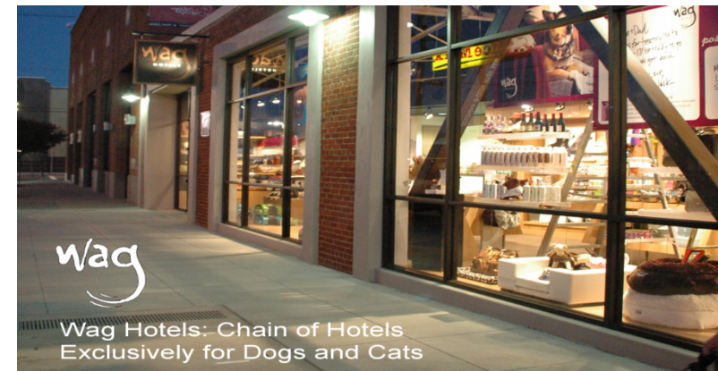
Wag Hotels: Chain of Hotels Exclusively for Dogs and Cats