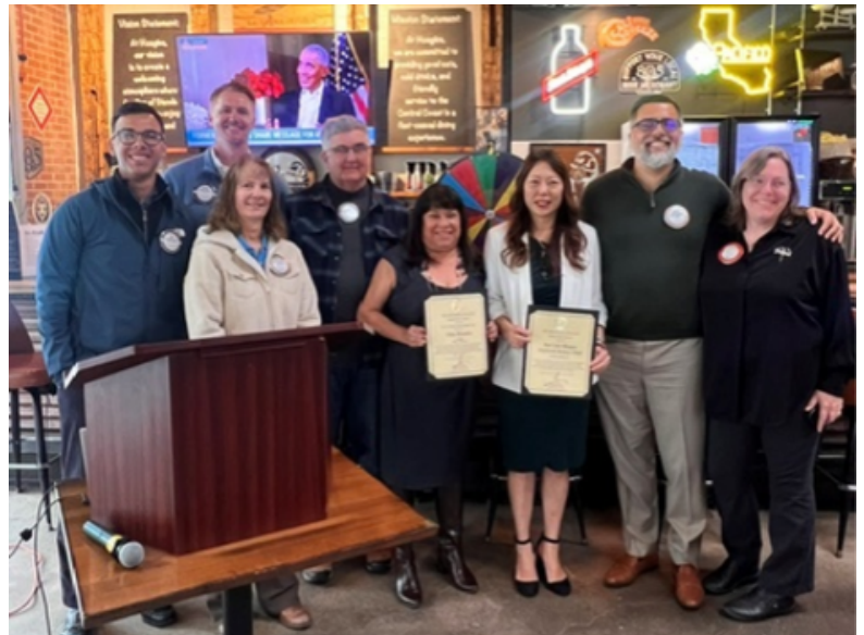
Pictured above: State Treasurer Fiona Ma (center) honored members from the San Luis Obispo Daybreak Rotary Club for their contributions to the San Luis Obispo community

As a global service organization, Rotary International Club Chapters focus on community projects, humanitarian aid, and leadership development.